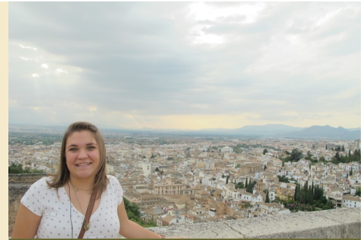
City view from Alhambra

We have a special dinner planned with everyone in the CEA program. I am not sure what it will entail. I have not encountered