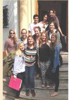
My class

any typical Thanksgiving foods in Spain; no mashed potatoes, no turkey, no green beans, pumpkin, not even a roll! Even though I don't know exactly what to expect for that evening meal, I will definitely celebrate Thanksgiving.