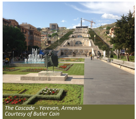
The Cascade - Yerevan, Armenia

I learned the answer to my toilet paper question soon enough. The bathrooms on the train car didn't have any. And that, of course, led to a new set of questions.