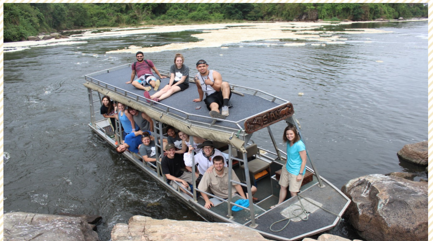
Nile River Expedition By Casey Watson, Uganda