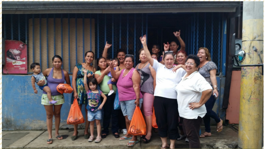
Strong Warriors