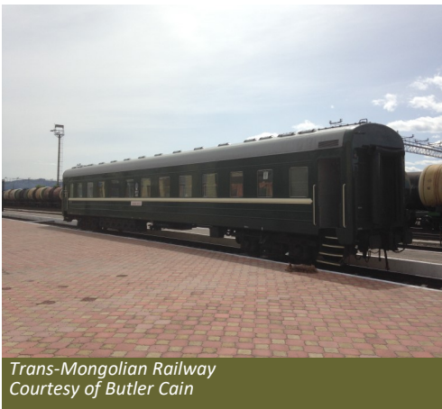
Trans-Mongolian Railway

Travelers ask themselves this question all of the time: What do they know that I don't?