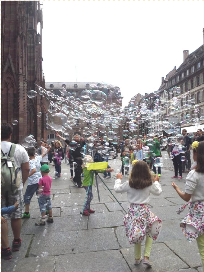
Bubbles at Notre Dame