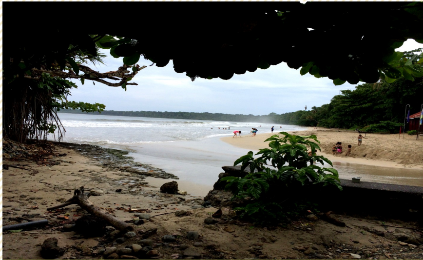
Beach = Peace By Lucia Gandara, Costa Rica